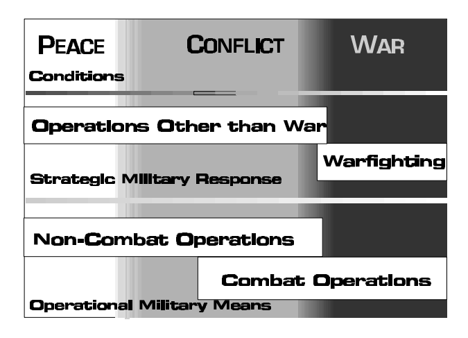
Figure 1-1: The Continuum of Operations projected on the Spectrum of Conflict

is crucial; each battle, engagement or operation must be planned and executed to accomplish the military objectives established by the commander. The aim of any force, therefore, is always determined with a view to furthering the aim of the higher commander.